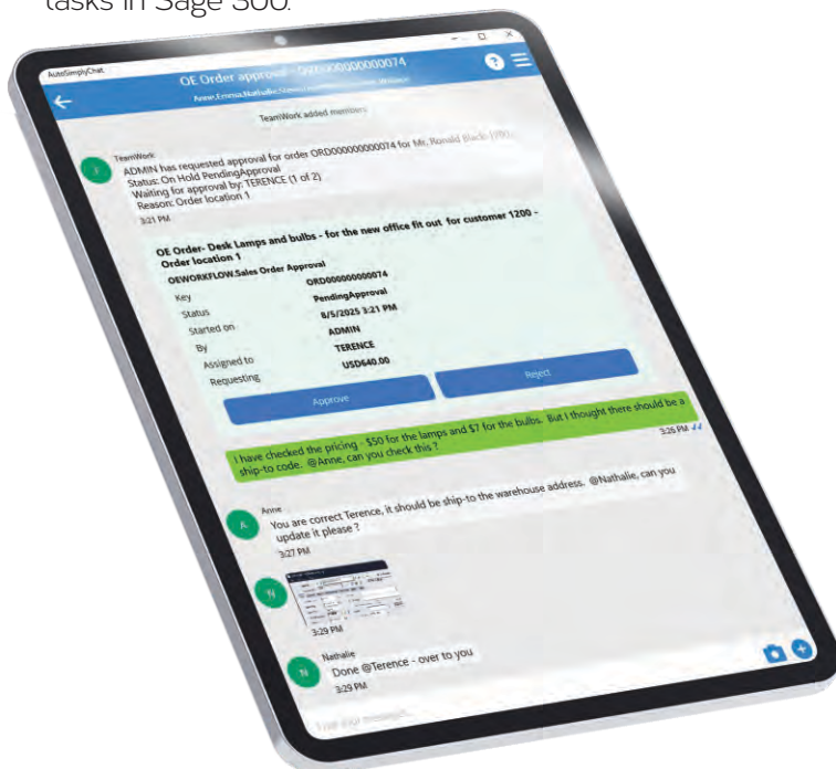
App-based Approval with associated Chat