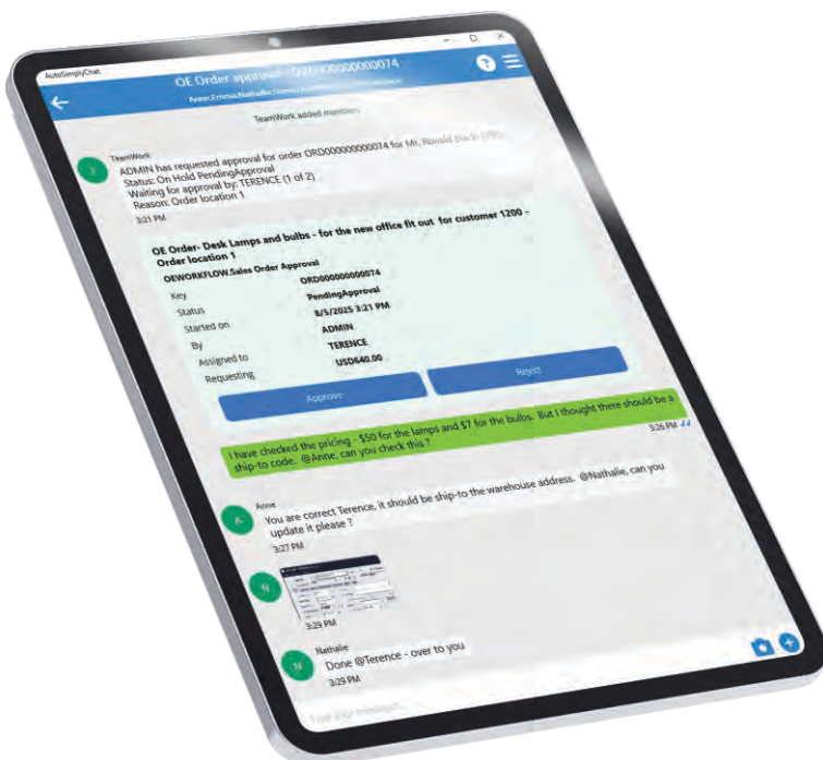
App-based Approval with associated Chat